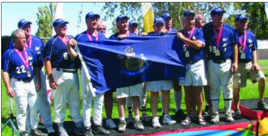
The WahlcoMetroflex Men's Softball Team from Maine took the Silver Medal in the 2009 National Senior Games. See list of team members on page 2.