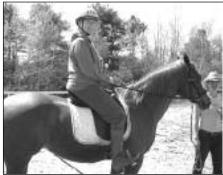
Horseback riding with Easy Adventures at Camp Ketcha in Scarborough.

Horseback Riding & Nature Walk sponsored by Camp Ketcha. Friday, September 25, 10AM-2:30PM. Cost: $10. Contact Marissa Leighton 207-883-8977 x104.